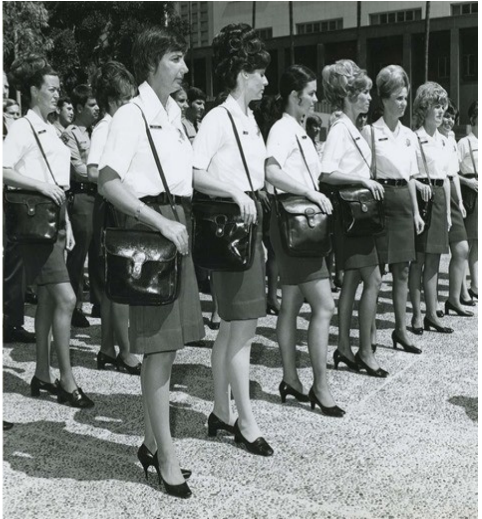
This was the female deputies uniform at the time the pilot program of sending females to radio car duties (Sept 1972). Field work was to be in skirts, high heels and their gun in a purse! It took 3 years for approval of pants and a gun belt for those females working the field in patrol units.