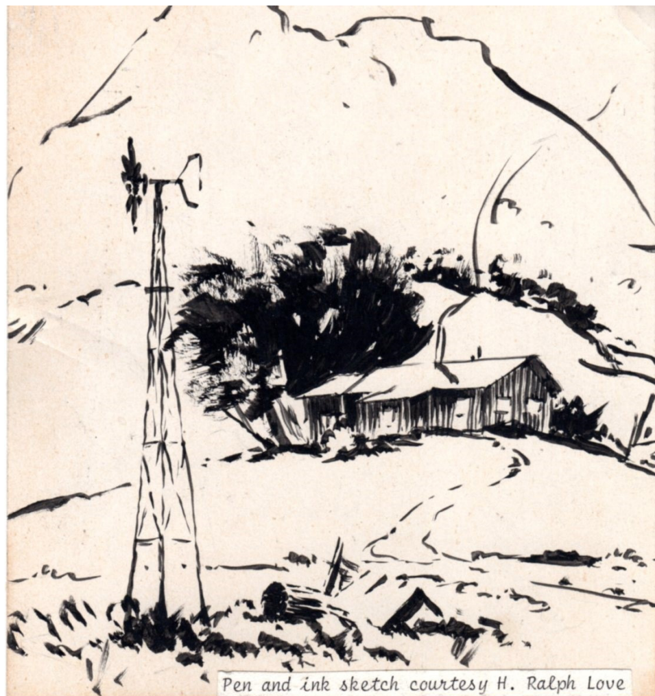
Pen and ink sketch courtesy H. Ralph Love