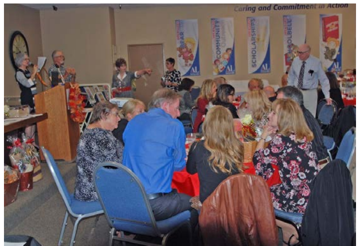
Working the raffle and auction