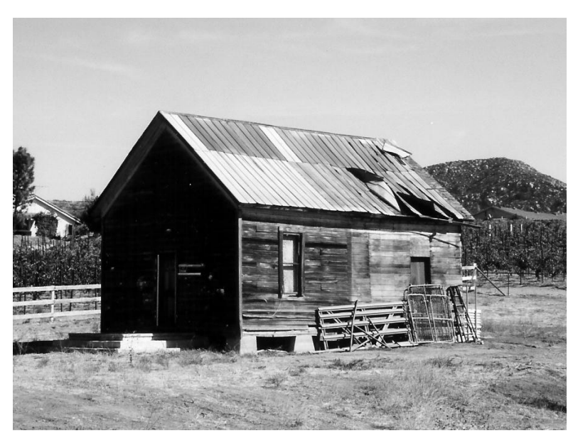
The photo above of the Old Hyatt Schoolhouse was taken about 8 years ago.

www.temecula valley historical society. org