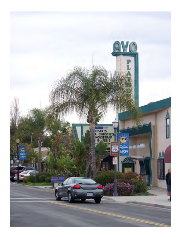
The Avo Playhouse on Main Street in Vista, CA

So remember, get off the interstate, slow down, and "Take a Drive on Route 395."