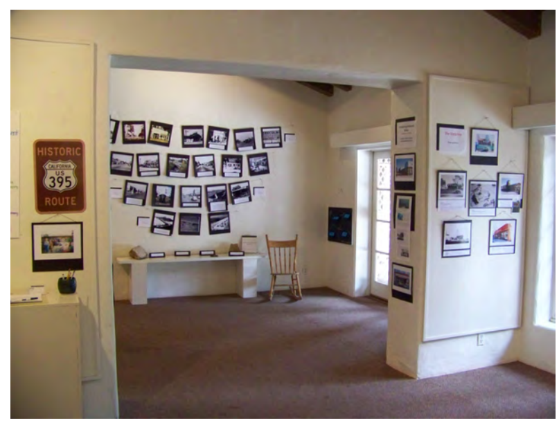
The Historic Route 395 Exhibit at the Rancho Buena Vista Adobe