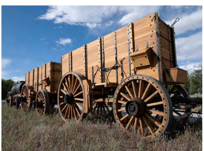
New exact replica set now on display in Bishop, Calif.