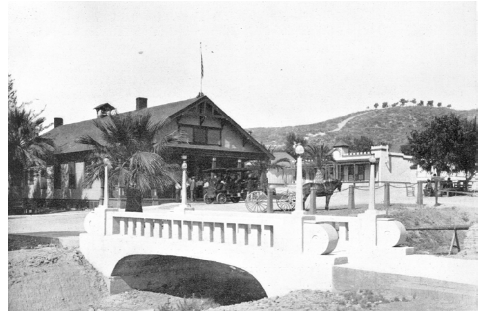
The office at Guenther's Murrieta Hot Springs circa 1914.