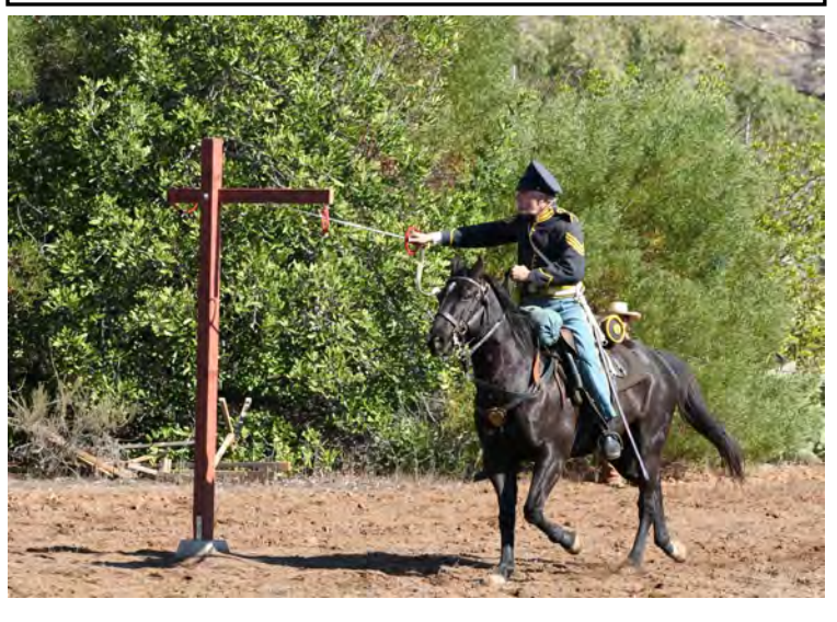
Period correct demonstrations with Mountain Howitzers and soldiers on horseback will be available.