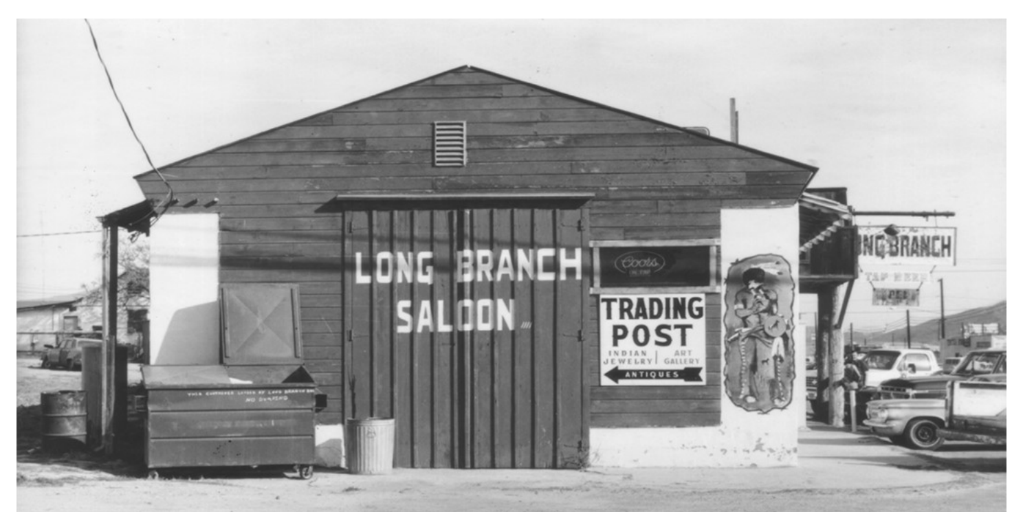
Long Branch Saloon had a storied past in the old building during the 1960's and 70's. It is said that at times various groups ranging from Hells Angels, cowboys, and others laid claim to it as "their bar". — Photo courtesy of Temecula Valley Museum

Photo courtesy of Temecula Valley Museum