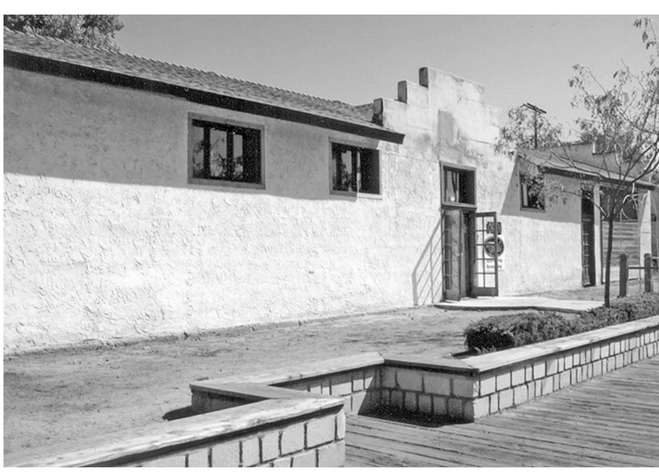
For many years this photo is what we saw at the corner of Main and Old Town Front streets, as Ms. Chievious ladies' clothing == Photo courtesy of VaRRA