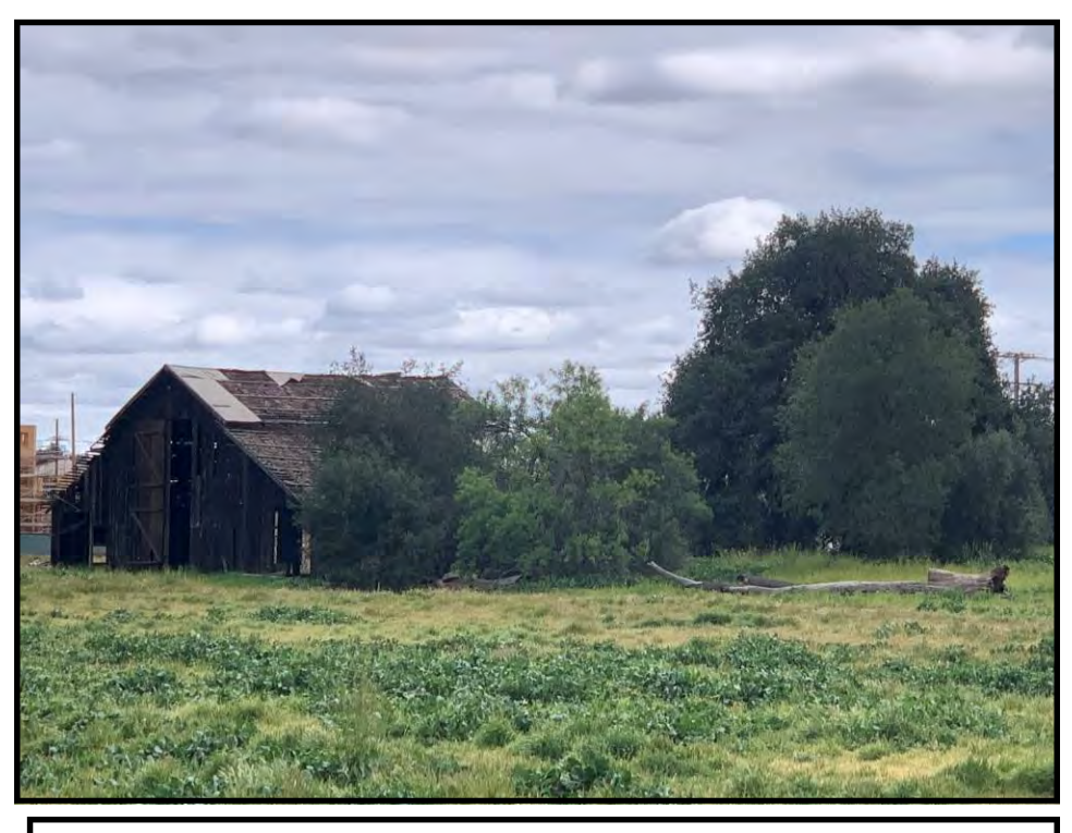
The Sykes barn is all that remains of the former Howard Sykes Ranch.