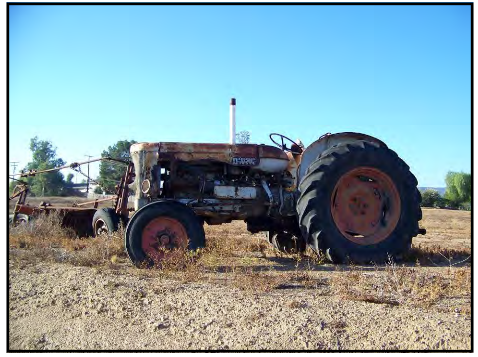
The Sykes tractor and other farm implements can be seen on display on Jefferson Ave.

For over 135 years, four generations of the Sykes family have lived in the Murrieta Valley. They have raised families, grown crops, operated businesses and contributed to the community's development. They have served in civic duties, volunteered their services, and gave when there was a need. The Sykes legacy should be remembered and celebrated for generations to come.