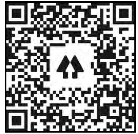
Scan the QR code to visit our website.