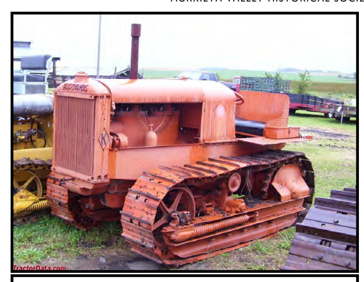
Allis Chalmers Model K Tractor (Internet Image)

Maurie used three tablers, one feeder and one wire tire and one man to either buck and weigh or buck and poke wires. He used two buck rakes and wouldn't allow more of a load than three shocks to a load so the tablers could pull it apart easier.