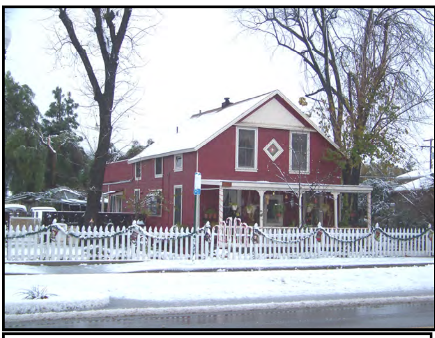
Snow covered the historic home on December 31, 2014